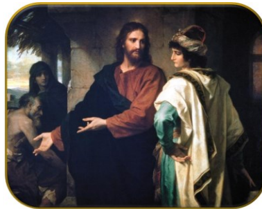
Christ and the Rich Young Man, Hofman

...and bring them to the Eucharistic Congress!