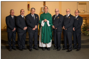
St. Mary, Milton Knights of Columbus Pallbearer Volunteers: →