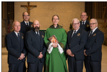
St. Joseph, Edgerton Knights of Columbus Pallbearer Volunteers ←